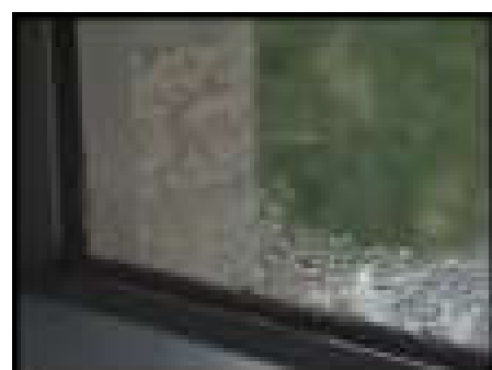
Condensation on windows